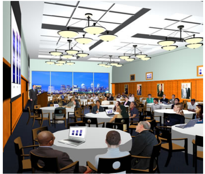
MBA Commons 7 th floor